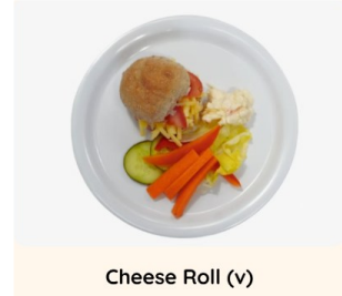
Cheese Roll (v)