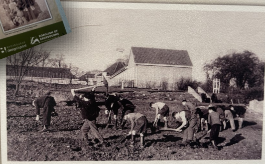
Children at Broxbourne School 'Dig for Victory', 1940.